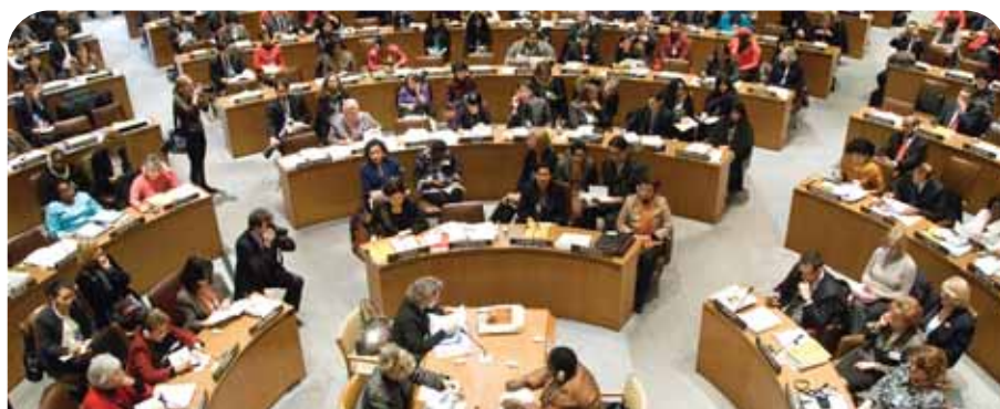
Opening of the 54th Commission on the Status of Women