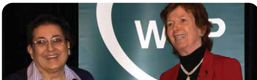
Thoraya Ahmed Obaid and Mary Robinson at the WLP event.

We are happy to give voice to other related news you want to spot! Write to: mdg3@ips.org .